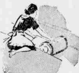
LIGHT—EASY TO INSTALL

Actual Tests Prove Partemp is the Finest Insulation Material Available on the Market Today. FHA Terms May be Arranged.