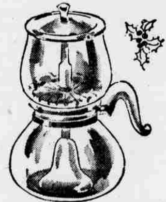
New Type, Designed by Silex! GLASS PERCOLATOR $2.95

And no gift list is complete without War Bonds and Stamps—gifts to make all our future Christmases brighter and happier ones!