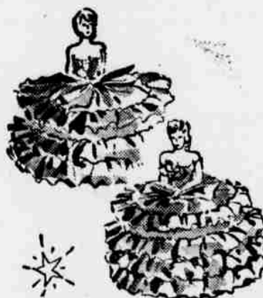
To Decorate Her Dressing Table! Novelty Pin Cushions 49c

Handsome tapestry fabric that will wear and wear! Neatly lined with rayon sateen! The folding wooden frame makes it convenient to carry about! It's 13" long, 7" wide when open, and 10" deep!