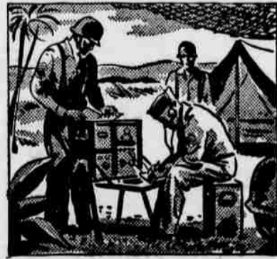
4. Blitz war requires swift communications! On the soldier's back, in field and sky, radio co-ordinates the striking force of American army planes, guns, and tanks.

General Electric believes that its first duty as a good citizen is to be a good soldier.