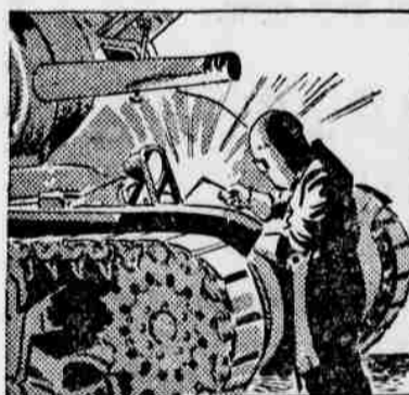
1. In the factory electricity stitches the seams of tank armor, and on the battlefield it controls the operation of these spearheads of modern combat.

... General Electric equipment is fighting with America's land army. From the rolling kitchen to the front line, electricity works for victory.