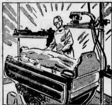
2. In induction center and field hospital, the X ray helps safeguard the health of our fighting men, aiding in the diagnosis and treatment of disease.