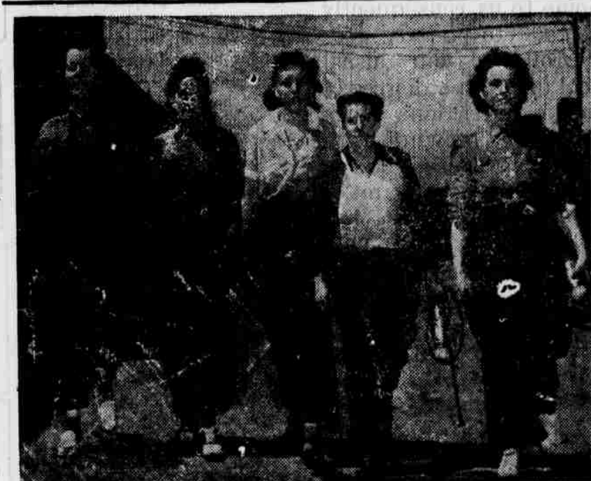
WOMEN AT WAR —Overalls, wrenches and drills replace fineries as these war workers in an Army Arsenal march to tank repair shops. Note the determination on their faces. These women are typical of hundreds of thousands who are working in war factories and investing part of their earnings in War Bonds.