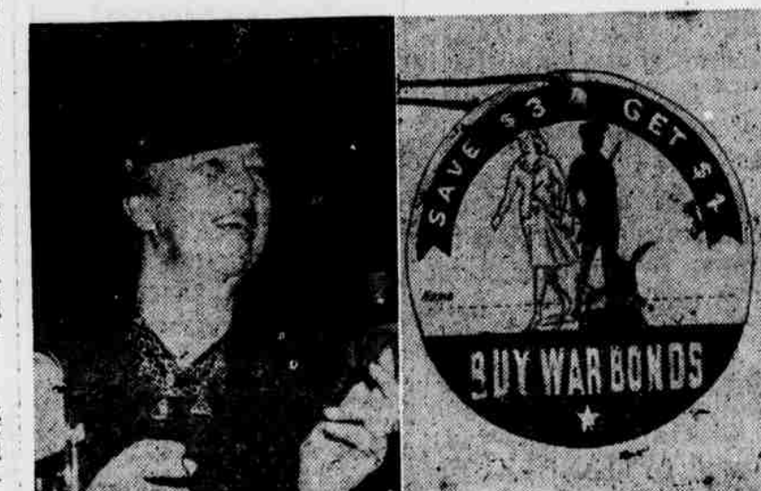
Mrs. Roosevelt (left) says women help men at front by buying War Bonds. At right is the lapel tag which volunteers will wear during Women At War Week, Nov. 22 to 28.