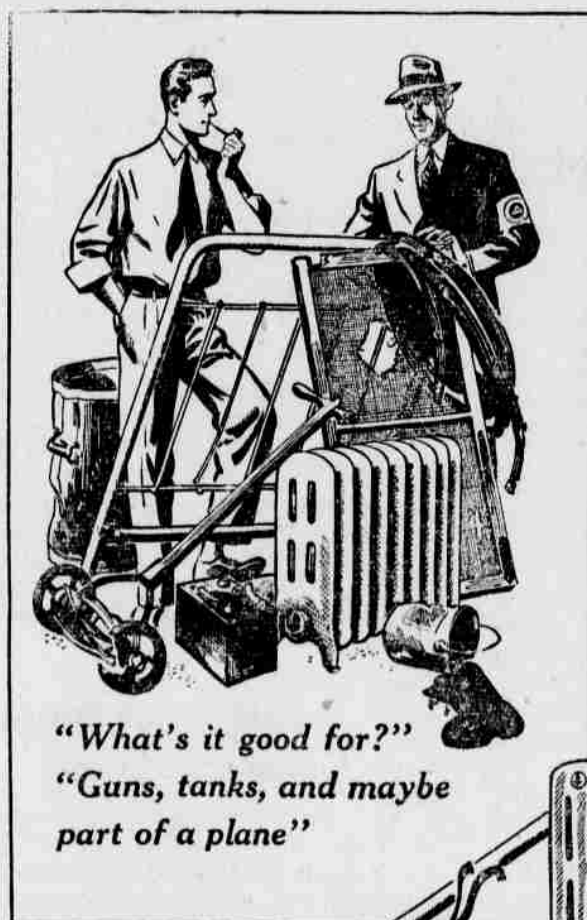
"What's it good for?" "Guns, tanks, and maybe part of a plane"

(For further details of regulations contact the local postmaster.)