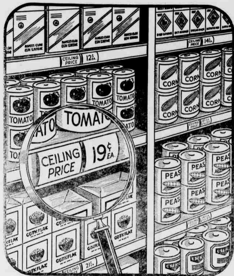
Ceiling Price may be shown for a group of identical items on the same shelf—such as canned tomatoes.