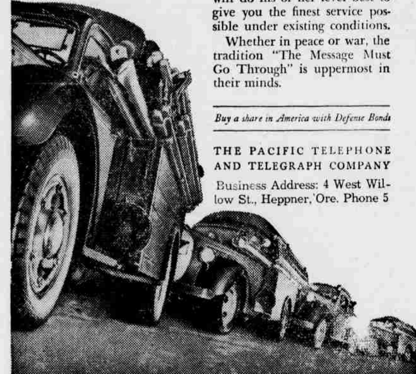
Buy a share in America with Defense Bonds

While it is necessary that our lines be readily available for telephone calls important to the wartime job, you may be sure that each telephone employee will do his or her level best to give you the finest service possible under existing conditions. Whether in peace or war, the tradition "The Message Must Go Through" is uppermost in their minds.