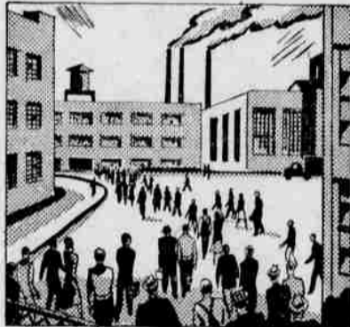
2. But today, with so many industries producing equipment for the Navy, the "E" has been awarded to a few factories, too.