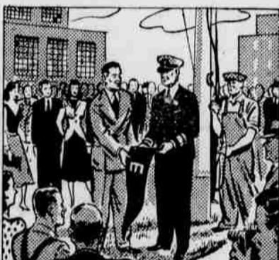
4. The "E" flag was hoisted September 19, and hundreds of Erie G-E employees are proudly wearing "E" buttons to show that they, too, share the honor.

General Electric believes that its first duty as a good citizen is to be a good soldier.