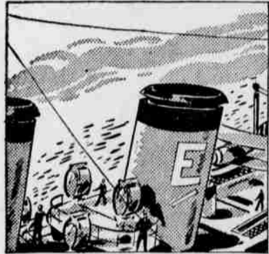
1. The "E" is the highest group honor awarded by the Navy. Crews work hard for it, and are proud to see it on their vessel.

It is the U.S. Navy "E." This symbol, on a Navy vessel, indicates special "excellence" in some activity such as gunnery or engineering.