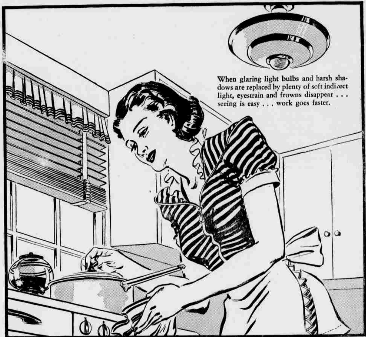
When glaring light bulbs and harsh shadows are replaced by plenty of soft indirect light, eyestrain and frowns disappear... seeing is easy... work goes faster.