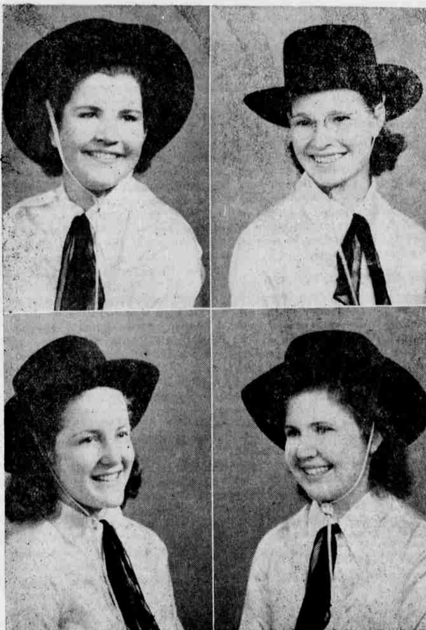
Princess Colleen Princess Frances