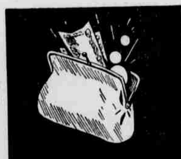
Save enough to make payments on your refrigerator!