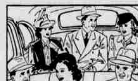
"3-Couple Roominess" in Sedans