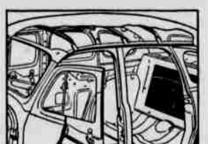
Solid Steel Turret Top