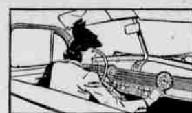
Style That's Outstanding

You ride in the body of your car as you live in the rooms of your home; and you ride in outstanding beauty, comfort and safety when you ride in a new Chevrolet with Body by Fisher!