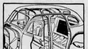
Ultra-Safe Unisteel Construction