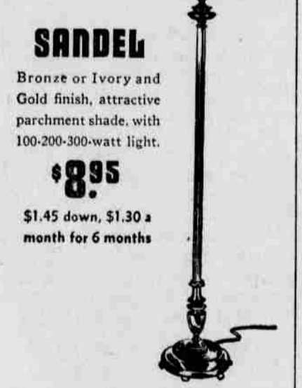
SANDEL Bronze or Ivory and Gold finish, attractive parchment shade, with 100-200-300-watt light.

$14.95 $2.45 down, $2.15 a month for 6 months