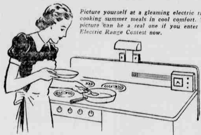
Picture yourself at a gleaming electric range cooking summer meals in cool comfort. This picture can be a real one if you enter this Electric Range Contest now.

Secure list of range dealers from your nearest Pacific Power & Light Company office. List alphabetically and include Pacific Power & Light Company as a dealer.