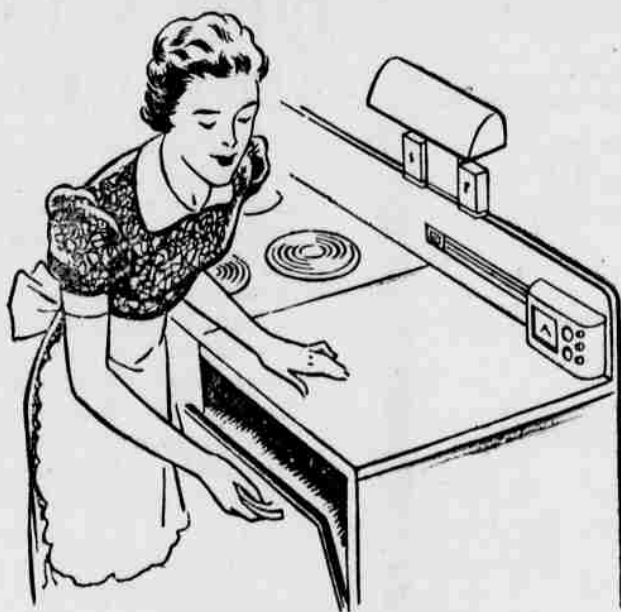
These facts about electric cooking will help you win!

Electricity provides your most modern way to cook, and the new 1940 electric ranges are the best that have ever been offered. They give you clean, dependable heat at the snap of a switch. They cut your kitchen hours and your work. They end guesswork ... enable you to prepare more delicious meals at lower cost. You cook in cool comfort on an appliance that combines the last words in beauty and efficiency. Visit a display now.