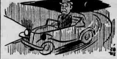
BUT ONE LIGHT ON A CAR IS A PRACTICE UNSOUND, IT MAY PUT THE DRIVER HIMSELF UNDERGROUND!