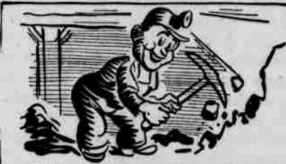
ONE LIGHT FOR A MINER IS SAFE AND OKAY, HE CAN WORK UNDERGROUND AND WHISTLE AWAY