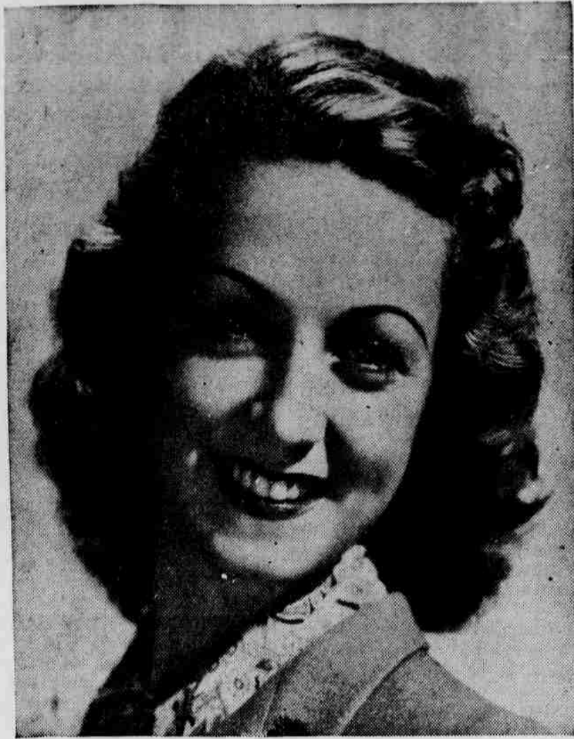
Danielle Darrieux, glamorous star of the French cinema, who makes her American film debut in Universal's "The Rage of Paris." Miss Darrieux speaks almost perfect English and is considered one of the world's most beautiful actresses.