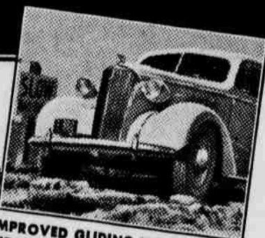
IMPROVED GLIDING KNEE-ACTION RIDE* (at no extra cost)—Giving what millions of Knee-Action users say is "the world's safest, smoothest ride."