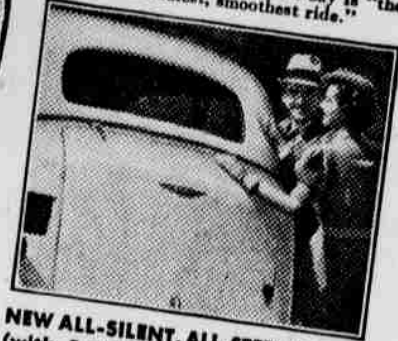
NEW ALL-SILENT, ALL-STEEL BODIES (with Solid Steel Turret Top and Unisteel Construction)—Wider, roomier, more luxurious, and the first all-steel bodies combining silence with safety.

It's the only low-priced car that brings you all these motoring advantages—the only low-priced car that gives you such outstanding beauty, comfort and performance together with such exceptional operating economy.