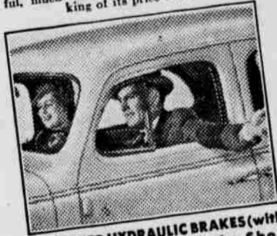
PERFECTED HYDRAULIC BRAKES (with Double-Articulated Brake Shoe Linkage) —Recognized everywhere as the safest, smoothest, and most dependable brakes ever built.