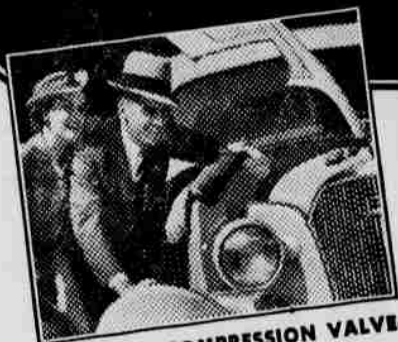
NEW HIGH-COMPRESSION VALVE-IN-HEAD ENGINE —Much more powerful, much more spirited, and the thrift king of its price class.