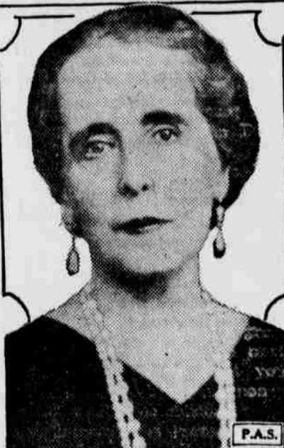
BUCHAREST, Rumania . . . Dowager Queen Marie of Rumania is reported seriously ill of intestinal poisoning at her palace here. Queen Marie has traveled extensively in the U. S., and is well-known for her writings.