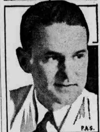
CHICAGO... Melvin H. Purvis (above), youthful "G-Man" of the U. S. Department of Justice who tracked the nation's master criminals, during the last 5 years, including Dillinger, is now on vacation after resigning. It is reported he will establish his own detective business here.

Fremont forest in the vicinity of Lakeview, Oregon, ranked third as a sufferer from lightning fires.