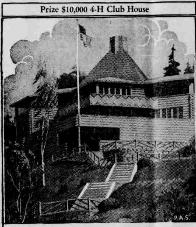
Prize $10,000 4-H Club House. CHICAGO... To the 4-H club members of St. Louis county, Minnesota, will go the $10,000 Club house (above), which is to be dedicated on August 22 at Lake Esauquagama, near Biwabik, Minn. It was awarded the Minnesota 4-H Clubs in a national contest for ranking highest in efficiency of their programs, contributing to social and business life of the region.

The U. S. Forest service "box score" of telegraphic fire information from the 150 national forests of the United States showed that Forest service protective crews prior to July were fighting an average of 28 fires each day. An average of 20 of these fires were man caused—mainly from unguarded campfires, carelessly dropped cigarettes, matches, and similar sources. National forests in the first half of 1935 had 3,238 fires as against 3,459 for the same period last year. However, 2,902 of the 1935 fires were man caused as against 2,279 for the first half of last year.