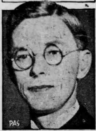
Dr. James Bryant Conant, new President of Harvard, broke a tradition at that university by posing for this photograph and welcoming reporters—a rule Dr. Lowell (retiring) never violated.