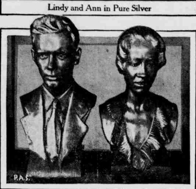
Lindy and Ann in Pure Silver. These new portraits busts in pure silver, of Col. and Mrs. Charles A. Lindbergh have been added to the Lindbergh Collection at the Jefferson Memorial Building in St. Louis.