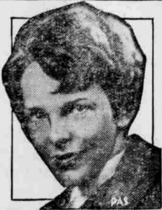
Mrs. Amelia Earhart Putnam, first woman to fly alone across the Atlantic, got to Ireland in spite of storms and a damaged plane.