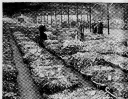
Auction today! Chesterfield buys the best