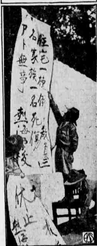
Japanese Boy Scouts put up a placard at Atami, after the great earthquake of Nov. 26, announcing their teacher had been killed in the quake.