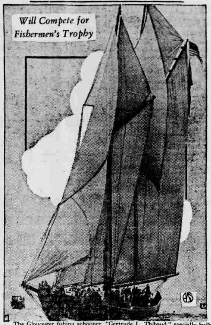
The Gloucester fishing schooner, "Gertrude L. Thibaud," specially built to race for the cup offered by Sir Thomas Lipton for a match between American and Canadian fishermen. The Canadian schooner "Bluenose" will be her opponent.

Hallowe'en program and party at Eight Mile Center schoolhouse Nov. 1, beginning at 7:30 p. m. Plenty of fun, plenty to eat. Everyone cordially invited.