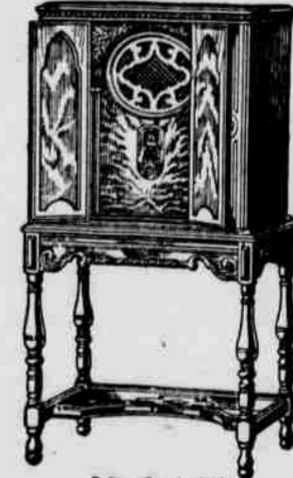
Model 92 $179.50 (less tubes)

FOUR TUNED STAGES RADIO FREQUENCY No A-C Hum