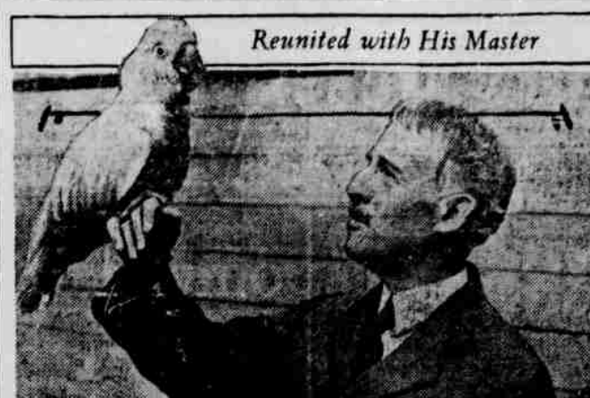
Reunited with His Master