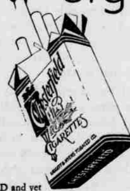
MILD and yet THEY SATISFY