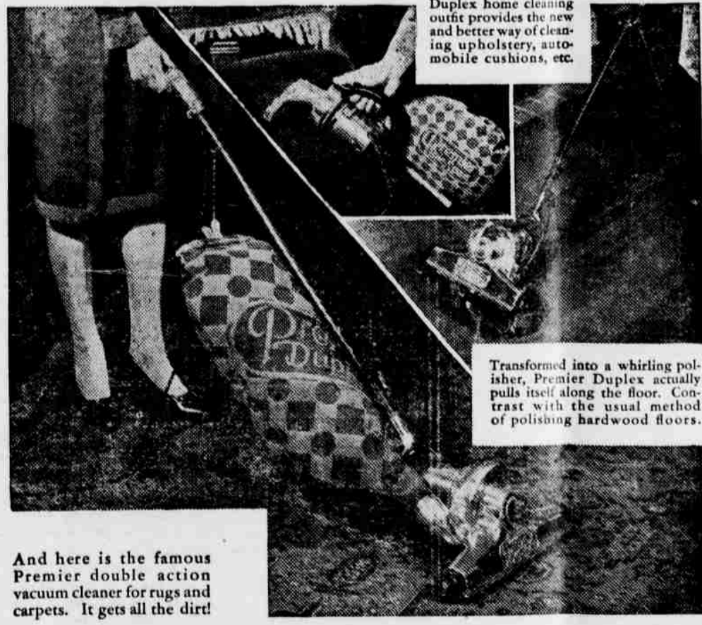
And here is the famous Premier double action vacuum cleaner for rugs and carpets. It gets all the dirt!

The little Spic-Span cleaner of the Premier Duplex home cleaning outfit provides the new and better way of cleaning upholstery, automobile cushions, etc.