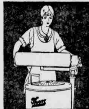
Place the Thor Rotary Iron in the wringer position.