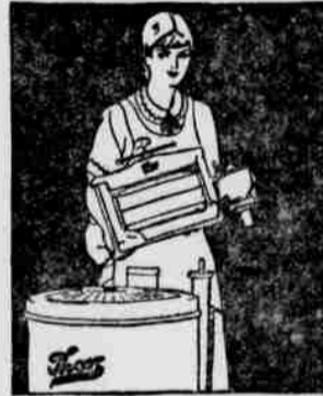
To iron, remove the wringer from the wringer shaft.