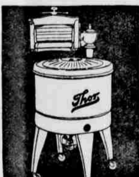
The new Thor Agitator washer, lowest priced quality washer in the world.