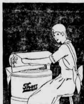
Then you sit in a comfortable chair while you feed the clothes through.

A complete home laundry—washer and iron together—for no more than the average washer alone! Or purchase the iron separately to operate on kitchen table, or on your present late Thor or Maytag washer. Prices now bring a rotary iron within the