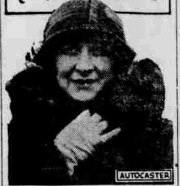
Mary Garden, opera star, injured accidentally during an opera scene in a Chicago Theatre, stifled her cries until she was carried behind the wings, and refused to allow news of her injury to be made public. Patrons did not suspect the substitution of a double.

Advantage of the deep snow by the skis and sleds. Several students have been absent from school the past week on account of illness and the deep snow. The Spanish class is progressing very rapidly this semester.