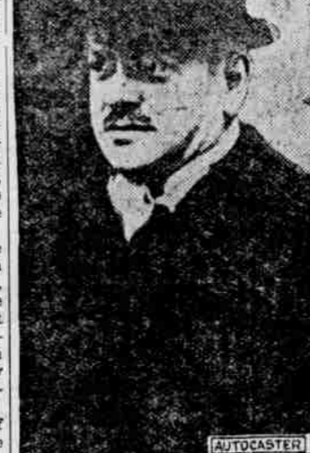
Gustav Stresemann, the famous Foreign Minister of Germany, who has expressed the opinion that the general acceptance of the Kellogg Treaty will help to modify the hardships under which the German Reich is laboring