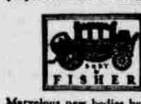
Marvelous new bodies by Fisher are an outstanding feature of the Outstanding Chevrolet.