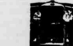
The new chromium plated radiator, lamp standards and rims, and one-piece full crown fenders are typical fine car features of the Outstanding Chevrolet.