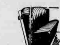
The adjustable driver's seat in all closed models. This brings the clutch and brake pedals within proper reach for all drivers.