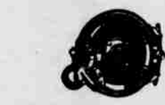
Newly designed four-wheel brakes, safe—positive—quiet.