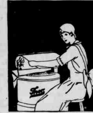
Six down as you iron. Pressure is automatic. No bearing down to snap strength and tire your wrists.