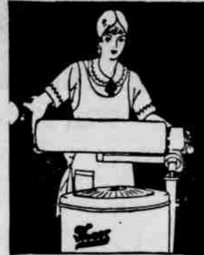
Put the new Thor Washing Iron on the washer in place of the wringer, in any of the wringer positions.