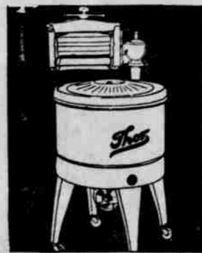
The new Thor Agitator Washer, lowest priced quality washer in the world. Fast, safe, and clean.