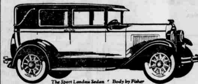
The Sport Landau Sedan Body by Fisher