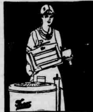
Just lift off the wringer when you're through with it. Transformation from washer to iron is easy.