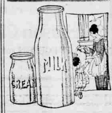
DRINK MORE MILK

College Year Opens Sept. 24, 1928 r information or entalogue write The Registrar, University of Oregon, Eugene, Ore