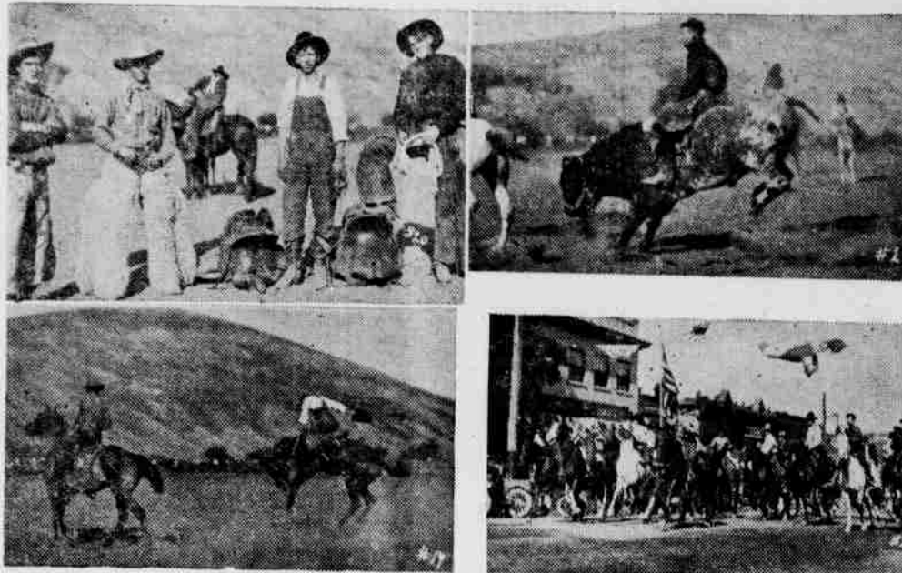
Seen at the Annual Round-up, the Heppner Rodeo, Recognized as one of the Best Shows of the West.