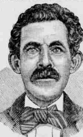
An early-day wood cut of the man for whom Heppner was named.

ernly furnished and up-to-minute apartments. This will fill a much felt want here. Even now these apartments are being occupied as soon as each is completed. A picture of this building is shown in this issue. The new apartment house will be a credit to the city and as an investment on his part will undoubtedly yield good return.