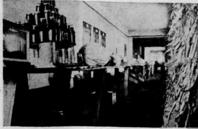
View of Exhibit at North Morrow County Fair, Held at Boardman Each Year, Showing Products Grown in Irrigated District.