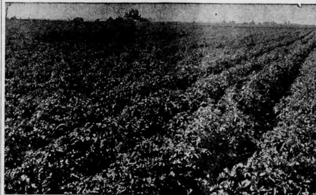
Growers in Many Parts of County Receive Big Returns from Tubers.

Give the Wife a Rest Send It to the Laundry