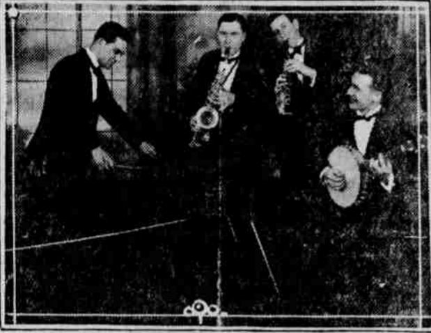
AMERICAN GLEE CLUB