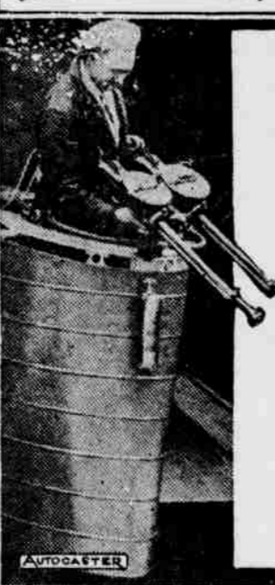
Three turrets and six mounted Lewis machine guns are on the newest type bombing biplane which Uncle Sam tested most thoroughly at Mitchell Field last week. The plane is of all metal construction.

Forbes owned it," he said, slowly. "But I thought you'd abandoned it. The taxes—"