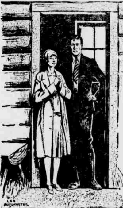
"Why, we can stay here tonight, Pat," he announced gleefully. "It won't be much of a job to clean up. Wonder if the pump's all right?"

know what to think. In fact, the waves of emotion which had passed over him made clear thinking impossible. He dared not hope; but the car wheels clicked endlessly: "The governor, the governor, the governor—" and it seemed a song of hope.