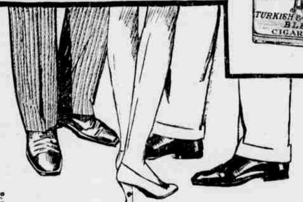
© 1927, R. J. Reynolds Tobacco Company, Winston-Salem, N. C.