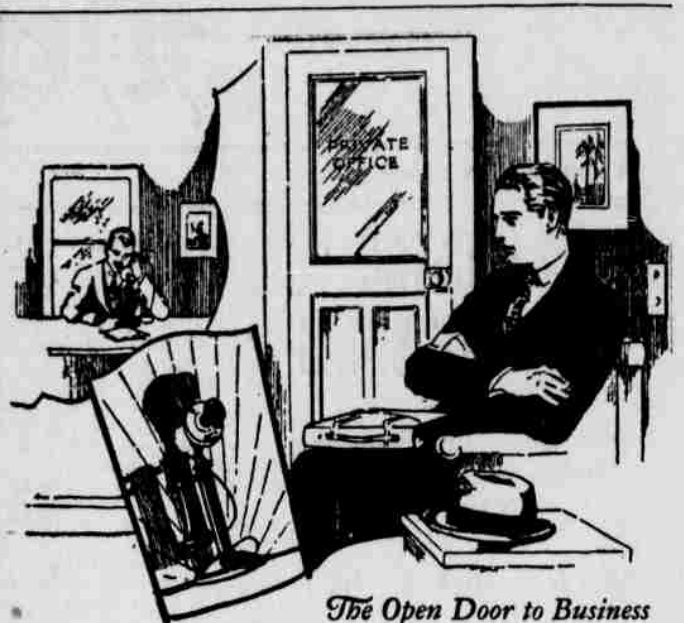
The Open Door to Business