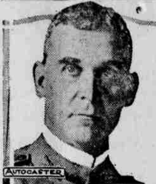
Maj. Gen. Chas. P. Summerall has been elected Chief of Staff of the U. S. Army to succeed Maj. Gen. John L. Hines.