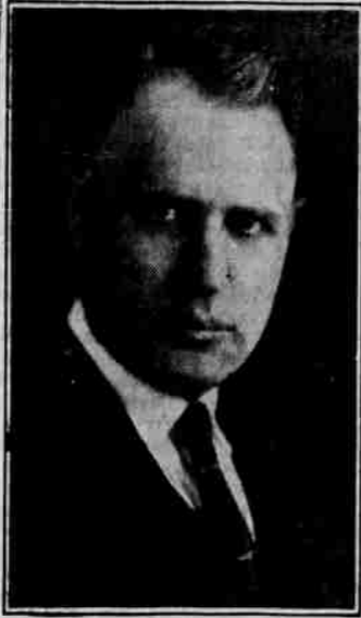
Salem, Ore., April 15.—Frederick Steiwer of Pendleton has officially filed for the republican nomination for United States senator.

"If nominated and elected," reads Mr. Steiwer's platform, "I will stand for strict attention to public business and a square deal to all men."