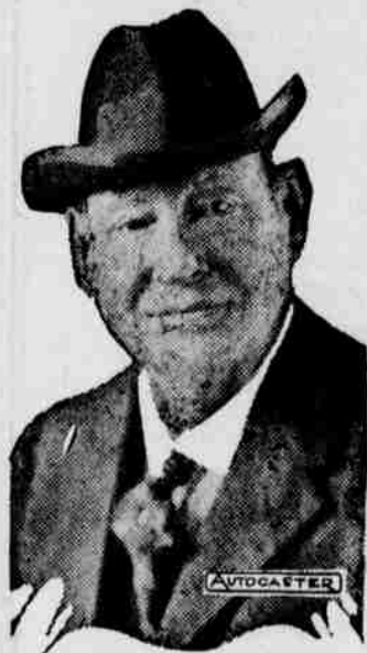
Dr. Harvey M. Wiley, has done much to insure the nation's health by his advocacy of pure food laws. Dr. Wiley lives in Washington, D. C. and is hale and hearty at 82.

Good rains are general again over the county and the wheat fields and ranges are receiving a good wetting. So far the grain fields never presented a finer appearance in most parts of the county, and with seasonable showers the yield should be abundant. Fruit trees are practically in full bloom, being about a month ahead of usual and we hope not soon that they may be nipped by the April frosts. However, as this has been a season when the expected has not happened so far, we may look for April to be a pleasant month and free from killing frosts.