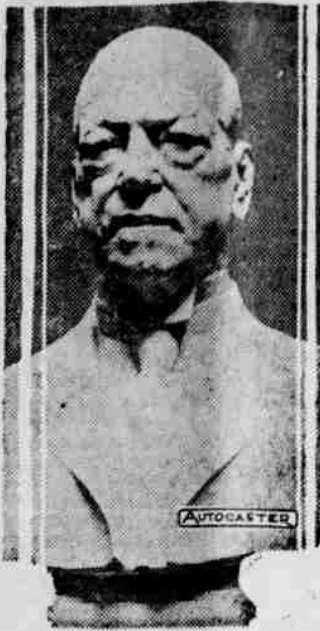
This is the newly sculptured bust of the late Samuel Gompers. American Federation of Labor will place this marble likeness of its former friend and leader in the National Museum.