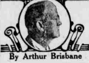
By Arthur Brisbane

Time, Space, Dizziness. Garter Bouquets. No Typical Boy. Poor Old Woman.