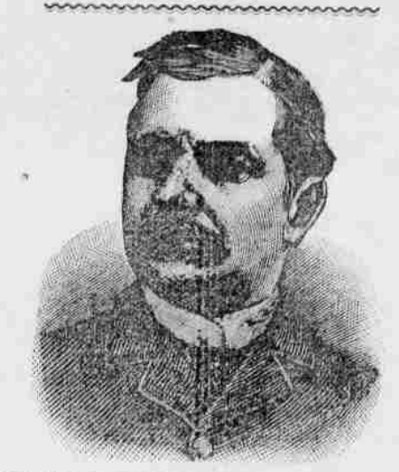
MAYOR HENRY BLACKMAN.