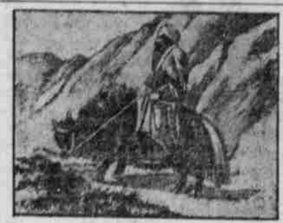
A MOUNTED LAMA.

a scaled book to tire rest of the world, sent. and the result of the expedition under Col. Younghusband, which the British have sent into the region, will be watched with interest. The high priests, or lamas, of Tibet have ever denounced the foreigner as an incarnated devil, and they preach that so rest of the universe, so long shall she gypsum, either white or delicately plorers have wandered across the corshaded, and occurs in fine quality at ners of this great tableland, clambered up some of its snow-clad mountains, Florence for the manufacture of vases, and visited a few of its stone cities; yet the greater part of its 650,000