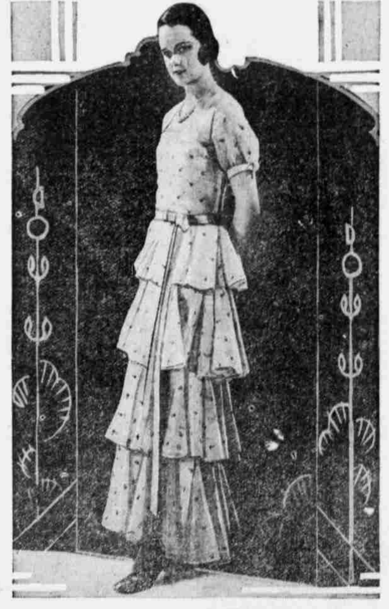
Lovely Party Frock

is in line for a program of embroidered effects which will range from dainty eyelet effects to elaborate allover patterning on firm-weave materials which will be made into sep-