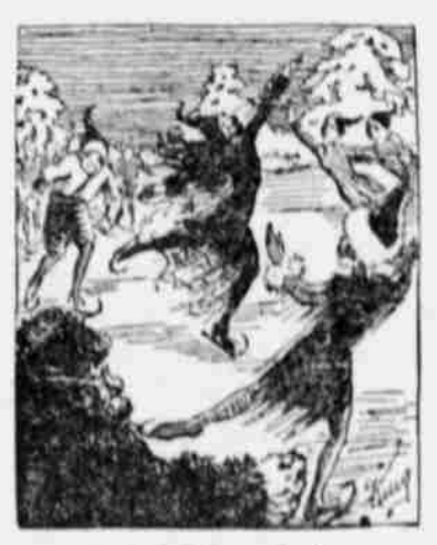
Dashed Off on the Ice.